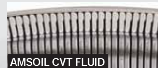
AMSOIL CVT FLUID