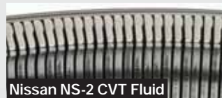
Nissan NS-2 CVT Fluid