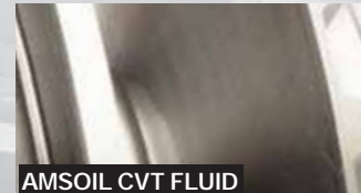
AMSOIL CVT FLUID

Order by Phone 1-800-956-5695 - Give Operator Reference #5121843